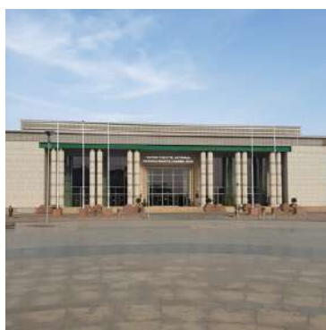
Grand Théâtre National de Dakar