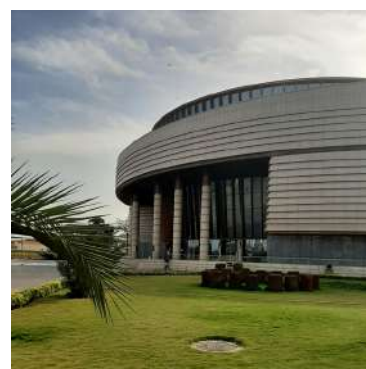
Musée des Civilisations Noires