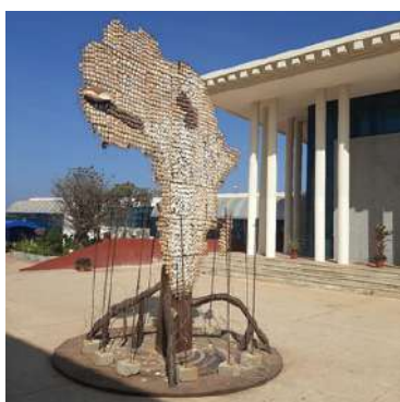
Place du Souvenir Africain