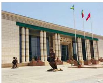
Musée des Civilisations Noires (on the right)