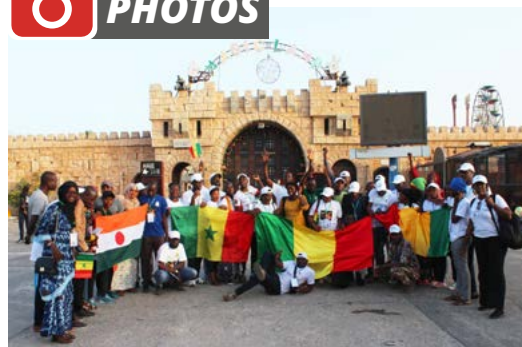
The caravanners of the DakarGSEF2023 Forum in Dakar