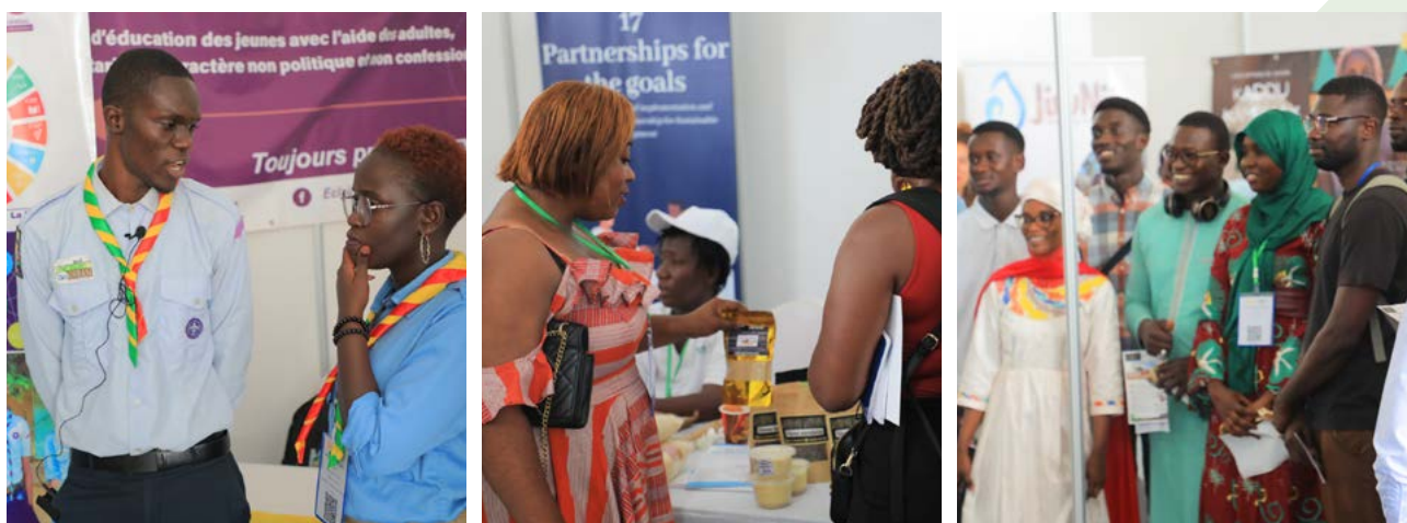
The SDG Village, Place du Souvenir Africain, Dakar